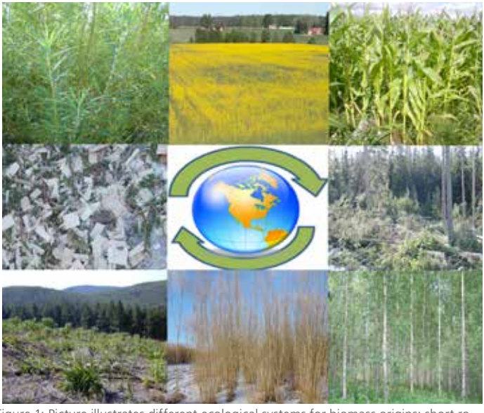
Figure 1: Picture illustrates different ecological systems for biomass origins: short rotation forestry, corn and sugarcane and managed forestry

Plants consist of different parts like roots, stems, stalks, branches, leaves, fruits, and fruit shells. Different parts of the plants can be used for different purposes: fruits for food, fruit shells, stalk and straw for energy, strong stems of trees for the saw mill and