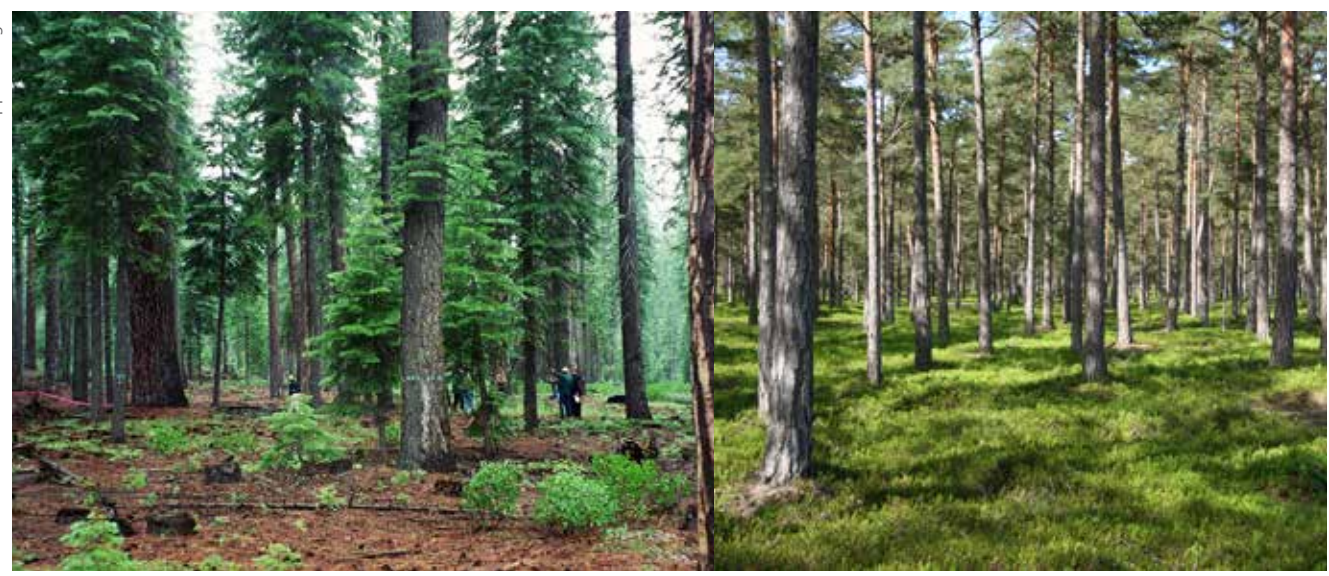
Figure 5: In a sustainable managed forest, trees of different age grow side by side, to left or in some cases even trees of even ages as shown to the right.

• The planting of new forests in order to compensate for the losses of forest in some regions, to increase the global forest area again and use part of this additional production for energy.