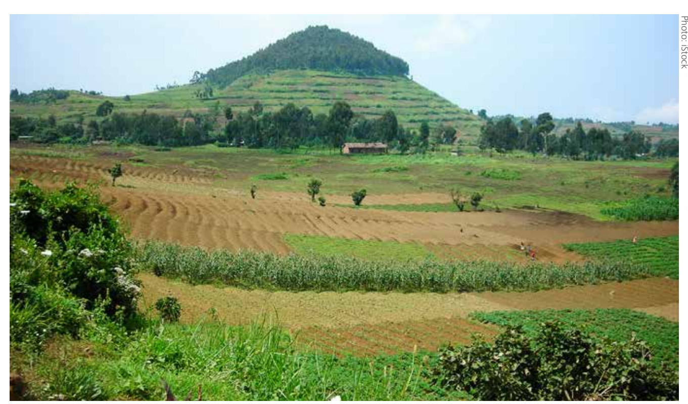
Figure 2: Tropical landscape can have high production of both agricultural and forestry products: Volcanic Cinder Cone and Tropical Agriculture Mudende, Rwanda