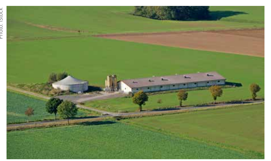
Figure 4: An agricultural system in rural areas

for biofuels in large quantities globally. Sugarcane has one of the highest yields for any crop and produces multiple products like cane juice and molasses for ethanol and bagasse for electricity and heat generation. Oil palm is a very productive crop if grown on the right type of land (not on drained peat or deforested areas) and used in a sustainable way.